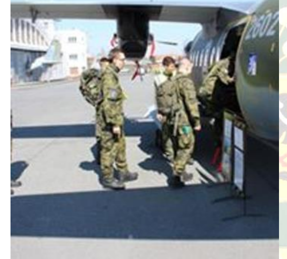
defence according to the laws.

Children are thanks to these activities (forums, static and dynamic demonstrations, discussions, etc.) learning directly from soldiers, how our army works, why are we in NATO, they practice the first aid or antichemical overall. In the same time, they can see military technologies, equipment and arms of the members of the Czech army.